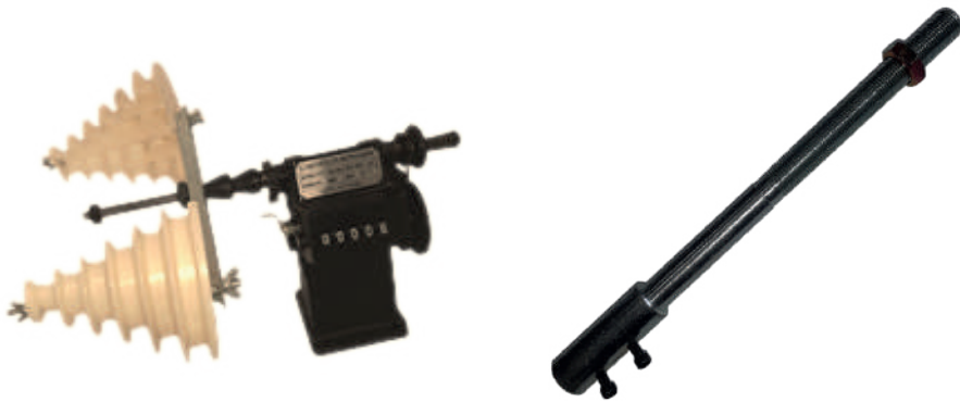
Image Manual winding machine with analog revolution counter BOZ1